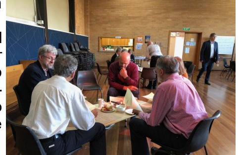
Café church on a Sunday evening.