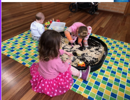
Others have fun with the dried oats and the race track, learning to play alongside each other.